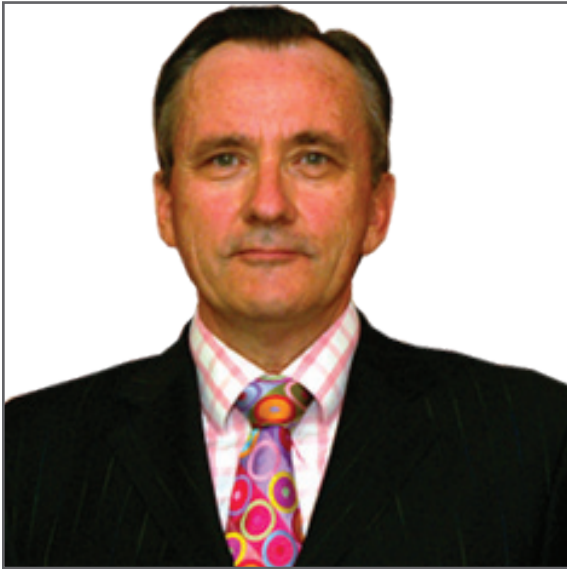
3.1 File type: .png (W: 118 x H: 83 mm) Resolution: 72 dpi File size: 102 KB

For images in their native file size, reference the blue two digit number below with the corresponding file name in the 'Images' directory of the disk provided.