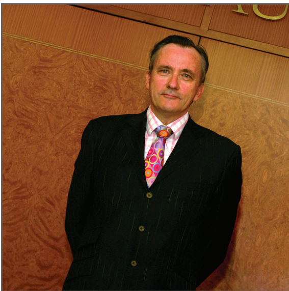
3.3 File type: .jpg (W: 706 x H: 1061 mm) Resolution: 72 dpi File size: 6.5 MB