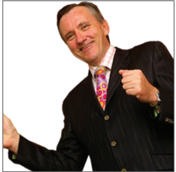
3.2 File type: .png (W: 118 x H: 83 mm) Resolution: 72 dpi File size: 102 KB